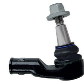
5 04066 M14