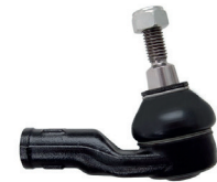
6 02659 M12