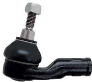
6 02659 M12