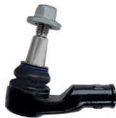
5 04066 M14